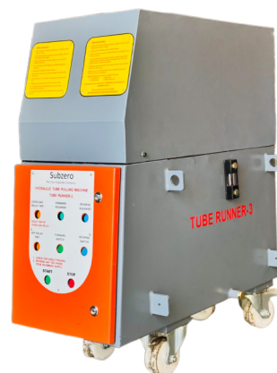
TUBE RUNNER - 3