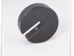
HORSE SHOE LOCK