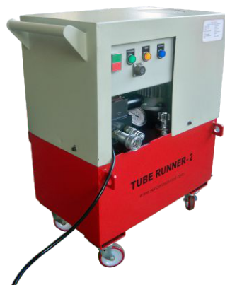
TUBE RUNNER - 2